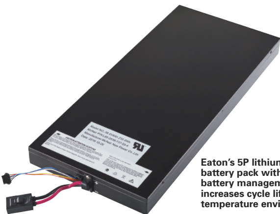
Eaton's 5P lithium-ion battery pack with on-board battery management — increases cycle life in higher temperature environments.

Building on the success of the 5P UPS platform, Eaton has reduced the weight, improved battery life and lengthened our warranty. These added benefits, in combination with the extended life of the product, provide you with the opportunity to align your UPS refresh cycles with the rest of the IT stack, saving time and money spent on labor and replacement batteries.